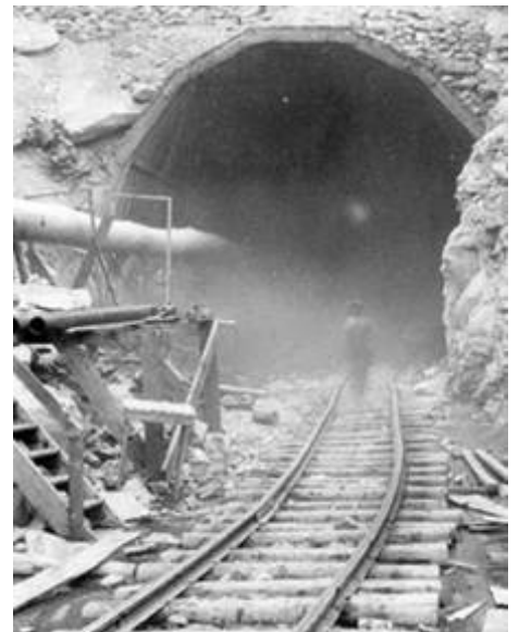
Ghostly apparition: A Black miner walking out of Hawk's Nest Tunnel, West Virginia, 1930.

but the number is difficult to ascertain since the company secreted the men's corpses in remote and remorseless graves. Now recorded as