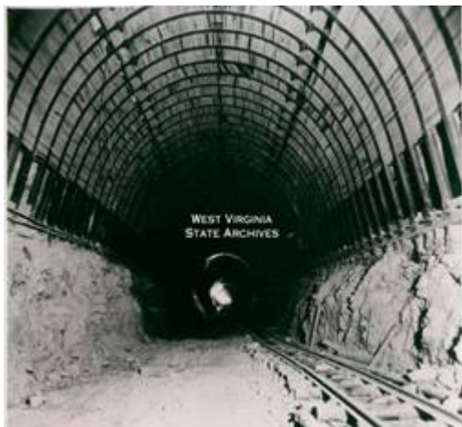
Hawk's Nest Tunnel construction, West Virginia, 1930-1931.

was no danger to the community; there was. Government investigators established that there were hazards, there were risks, chemicals were released and the company had systematically lied about